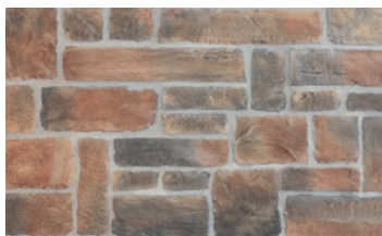
025 Mix Colorado